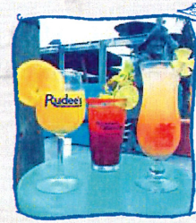
Souvenir Glassware & More!