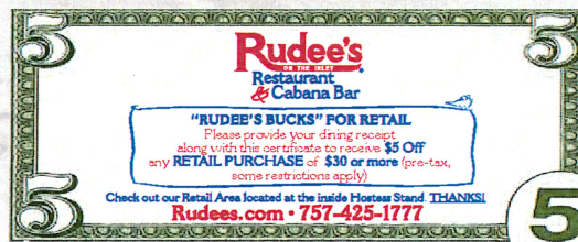
Ask your server for retail discount details!