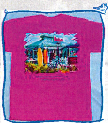
Short & Long Sleeve T-Shirts