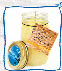
Secret of the Islands Salt Scrub