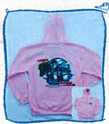
Crewneck & Hoodie Sweatshirts

Visit our Retail Area inside the main restaurant! Ask your server for details!