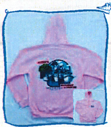
Crewneck & Hoodie Sweatshirts

Visit our Retail Area inside the main restaurant! Ask your server for details!