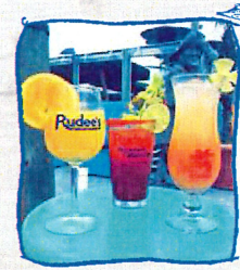
Souvenir Glassware & More!