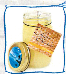
Secret of the Islands Salt Scrub