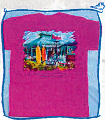
Short & Long Sleeve T-Shirts